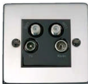
311 & 440

Selecting from a range of module inserts covering all manner of media transfer, the installer will now be able to configure their own arrangement of tv, radio or satellite reception, plus speaker, telephone and data outlets. All modules can be inserted into single or double wall plates, fitted onto standard switch and socket boxes.