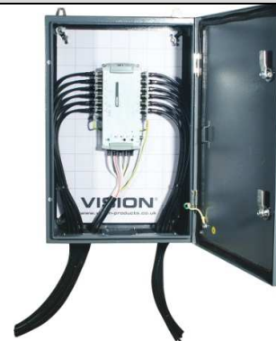
V45-600 illustrated above, with V5-524 multiswitch installed with 24 subscriber cables and 5-core trunk cable.

Vision equipment cabinets are manufactured to meet or exceed IP65 when they leave the factory. To maintain this level of protection care must be taken preparing and sealing and cable entries made into the cabinet by using a suitable cable gland and/or suitable sealing material. Vision Products (Europe) Ltd. cannot be held responsible for the actual level of protection achieved once a cabinet has been adapted or modified in any way.