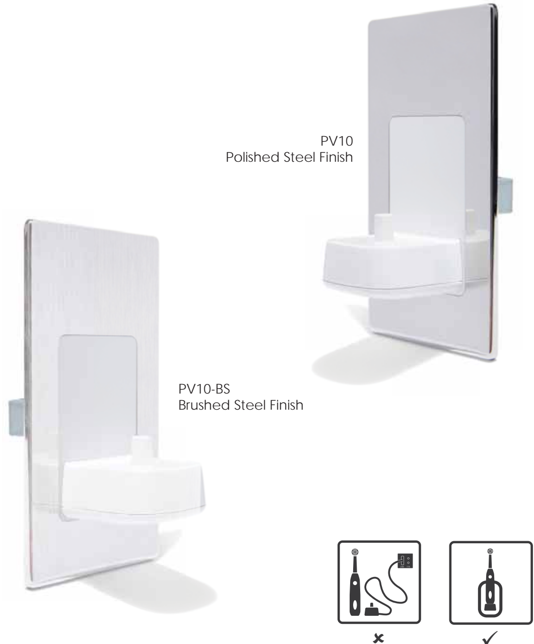
PV10 Polished Steel Finish