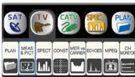
New Icon Navigation Menu