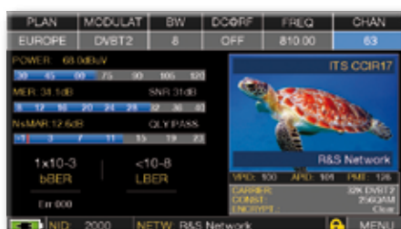
New Meas. & Pict. Super fast