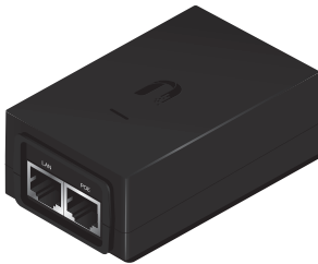
POE-24-24W POE-24-24W-G POE-24-30W