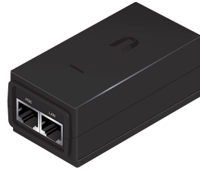
POE-15-12W POE-24-12W POE-24-12W-G