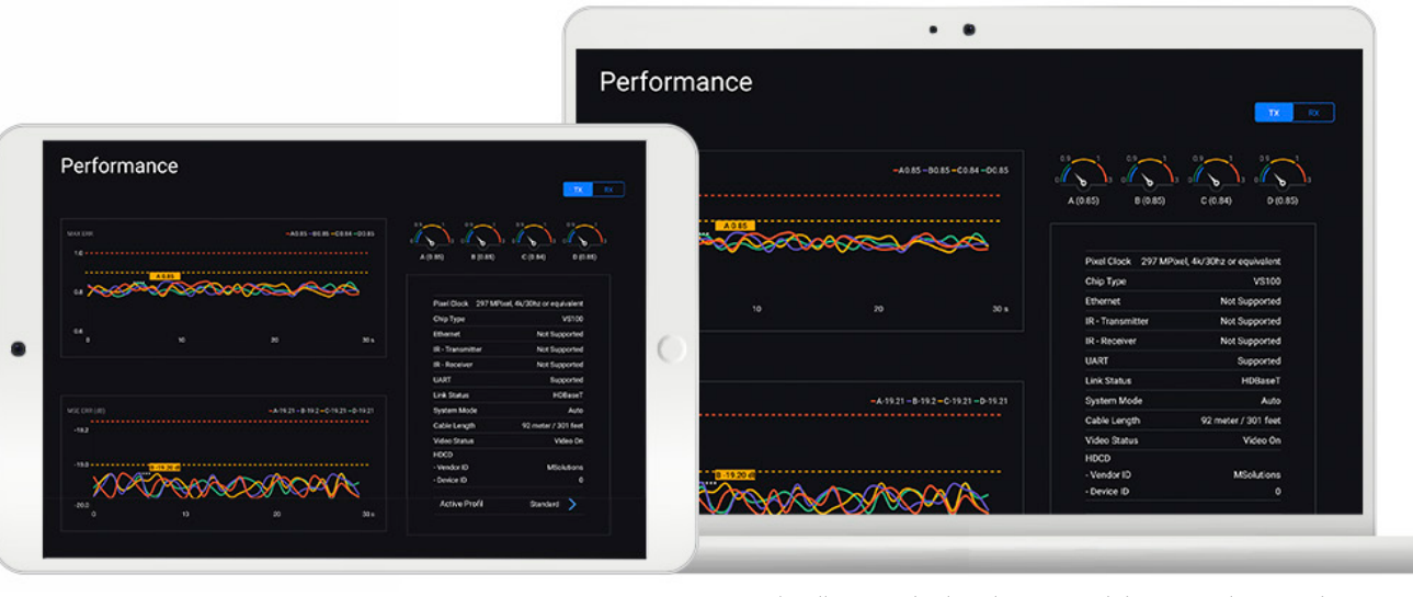
* Full testing displayed on any web browsing device such as a PC or tablet.