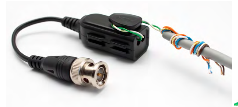
Strain Relief Feature

The superior interference rejection and low emissions allow video signals to coexist in the same wire bundle as telephone, datacom. This allows the use of a shared or existing cable plant. There is built-in surge suppressor to protect video equipment against damaging voltage spikes. Its crosstalk and noise immunity ensure quality video signals.