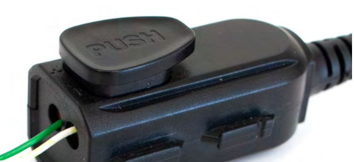
Easy Push Button for Cable Entry