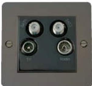
311 & 440