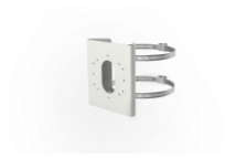
DS-1275ZJ-S-SUS Vertical Pole Mount