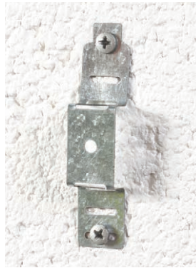
2x D-Fixings in Safe-D F-Clip 40