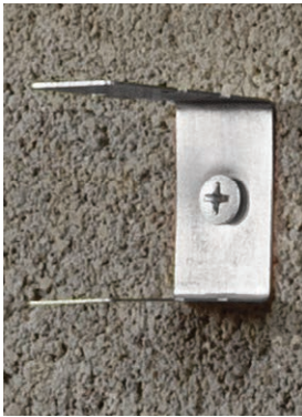
D-Fixing in Safe-D U-Clip 40

*Pullout loads based on 35mm embedment, 4mm pilot hole