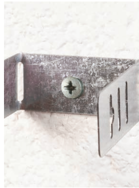
D-Fixing in Safe-D F-Clip 50