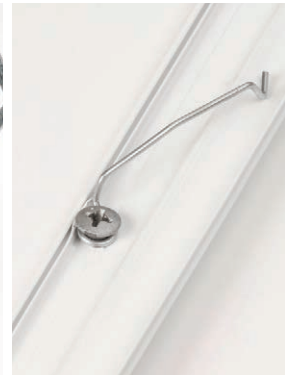
Spring Clip with D-Fixing

D-Fixings are fire-rated, with a 40mm long shaft and close threads which combine to provide exceptional performance. D-Fixings are ideal for securing D-Line Safe-D ranges, and other electrical installation equipment. D-Fixings can be used in masonry, plasterboard / breeze-block, concrete, brickwork and wood.