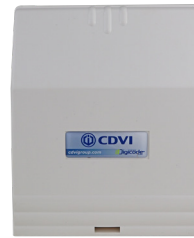
Remote electronics (included)