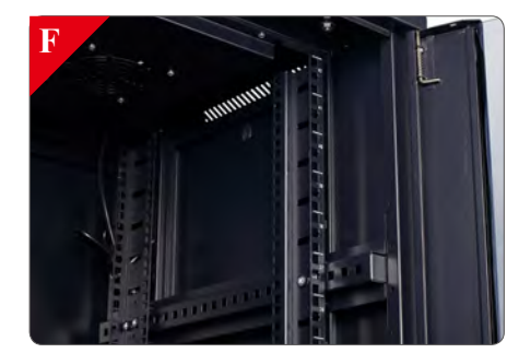
Front and rear of sets rails adjust in quarter inch increments. Simply unscrew the rails, adjust them to the required depth and refasten.

Part code: CAB476X6 | Colour: Black RAL9005