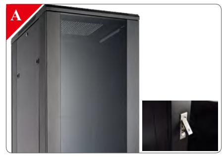
The tempered lockable glass door.