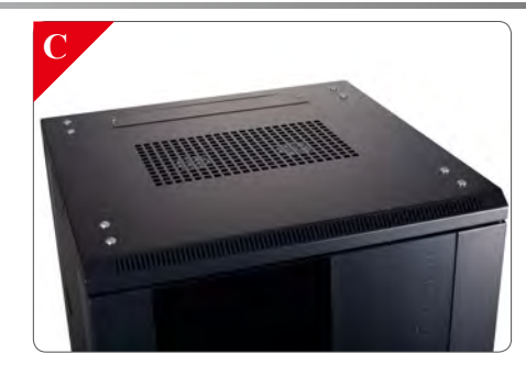
Optional Fan tray(2 fans for 600mm,4 fans for 800mm or 1000mm deep rack) allow air flow in the cabinet.