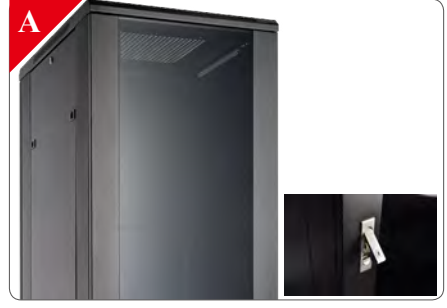
The tempered lockable glass door.