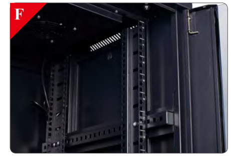
Front and rear sets of vertical rails adjust in quarter inch increments. Simply unscrew the rails, adjust them to the required depth and refasten.

Part code: CAB426X6 Colour: Black RAL9005 Static Loading Capacity: 800kg Useable Depth: 550mm Ret Weight: 83kg Gross Weight: 86kg