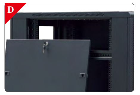
Lockable and removable side panels.