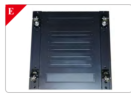
Base cable entry