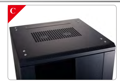
Optional Fan tray(2 fans for 600mm,4 fans for 800mm or 1000mm deep rack) allow air flow in the cabinet.