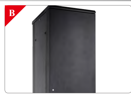
Lockable Rear Door.