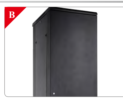
Lockable Rear Door.