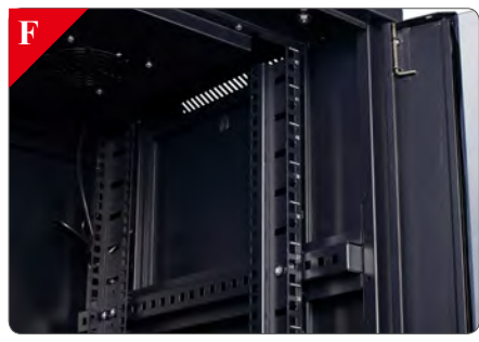
Front and rear sets of vertical rails adjust in quarter inch increments. Simply unscrew the rails, adjust them to the required depth and refasten.