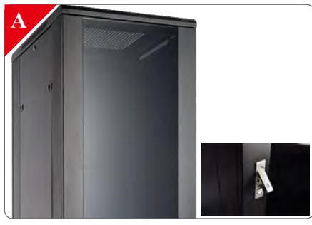
The tempered lockable glass door .