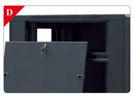
Lockable and removable side panels.