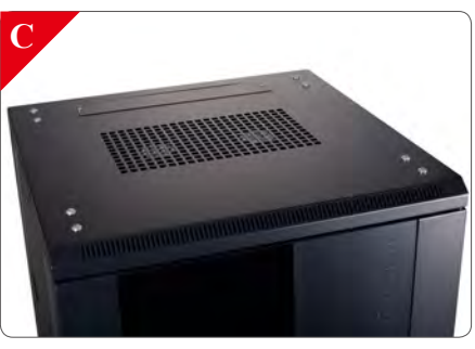
Optional Fan tray(2 fans for 600mm,4 fans for 800mm or 1000mm deep rack) allow air flow in the cabinet.