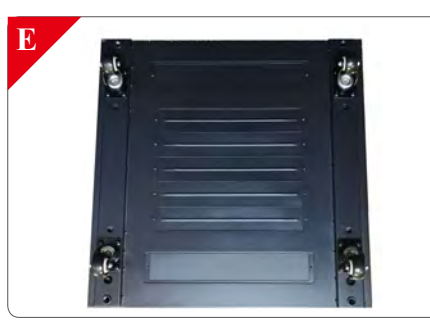
Base cable entry