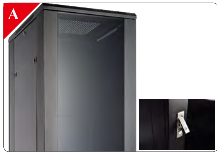
The tempered lockable glass door .