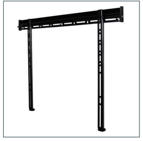
Available in Black