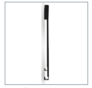
Low profile design mounts screen only 20mm (0.8") from wall