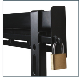
Locking bar for secure installation*