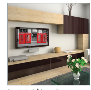
Easy to install in any home