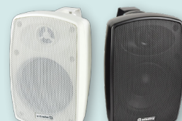
AVF-SS1W / AVF-SS1B