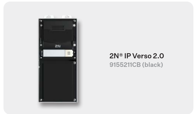
2N® IP Verso 2.0 9155211CB (black)