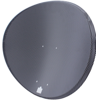
1 – Reflector

Not supplied in dish package - LNB, feed clamp and mounting button Coach screws and nylon plugs