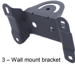
3 – Wall mount bracket