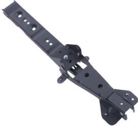
2 – Antenna bracket