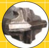
Old 90° head.