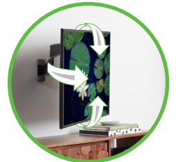
FluidMotion™ design provides effortless TV movement