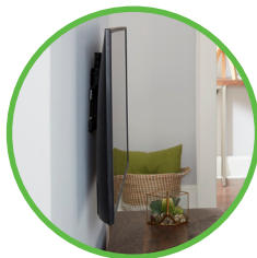
Slim full-motion mount sits just 1.8" from the wall in home position accentuating the sleek look of ultra-thin TVs