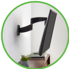
Steady Set™ holds TV in exact position – preventing drift and unwanted TV movement