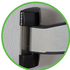
Stylish brushed metal exterior seamlessly blends with TV and décor