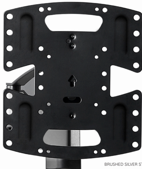
BRUSHED SILVER STAINLESS