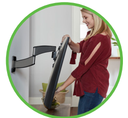
Virtual Axis™ provides fingertip tilt