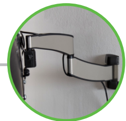
In-arm cable management creates a clean look