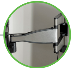
In-arm cable management creates a clean look