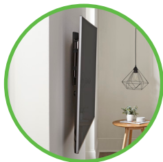
Slim full-motion mount sits just 2.04" from the wall in home position accentuating the sleek look of ultra-thin TVs