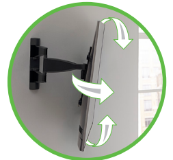
FluidMotion™ design provides effortless TV movement