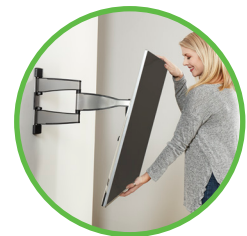
Virtual Axis™ provides fingertip tilt