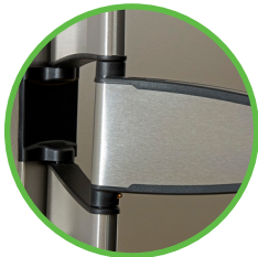
Stylish brushed metal exterior seamlessly blends with TV and décor