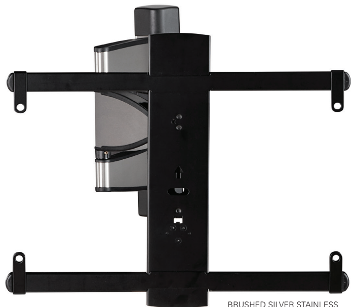
BRUSHED SILVER STAINLESS