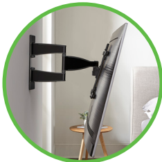
Steady Set™ holds TV in exact position – preventing drift and unwanted TV movement