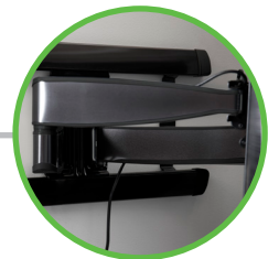
In-arm cable management creates a clean look