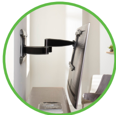
Steady Set™ holds TV in exact position – preventing drift and unwanted TV movement