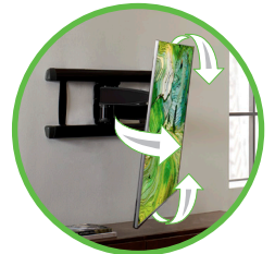
FluidMotion™ design provides effortless TV movement