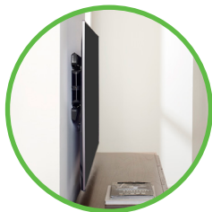
Slim full-motion mount sits just 2.15" from the wall in home position accentuating the sleek look of ultra-thin TVs