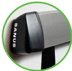
Stylish brushed metal exterior seamlessly blends with TV and décor