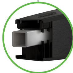
Precision-engineered, ultra-strong, solid steel frame provides maximum support